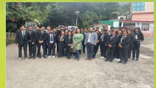
One day tracking activity to Karol Hills, Solan.