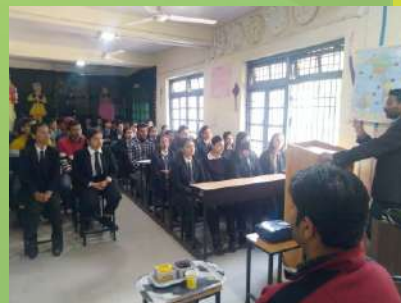
Seminar on Entrepreneurship by MSME Department of Govt. of India