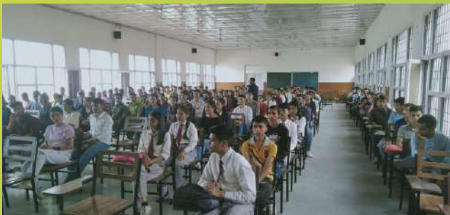
Counselling Session by HCL Technologies.