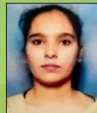
Rajni (2023) Anudip Foundation