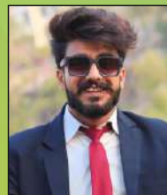
Manjeet (2023) Omninos Solutions