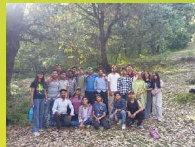
One day tracking activity to Karol Hills, Solan.