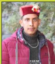
Jayant (2023) Omninos Solutions