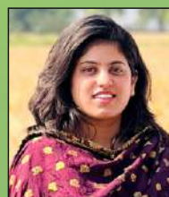
Harman (2022) Excellence Technology