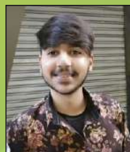
Umang (2022) Omninos Solutions