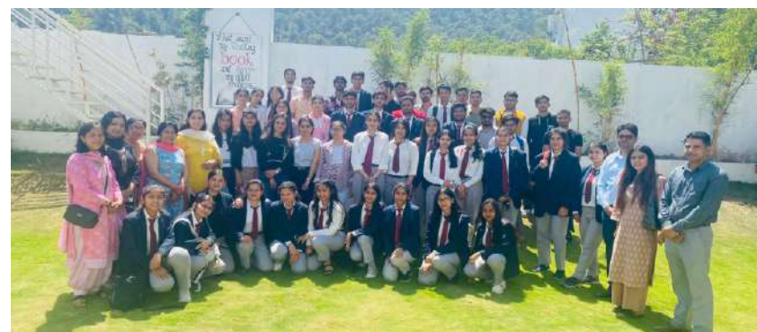
Educational Field Visit of BCA Students to Shoolini University, Solan.