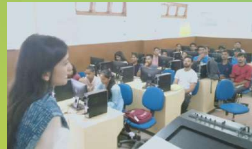
Counselling Session for BCA students, organised by HPKVN Shimla