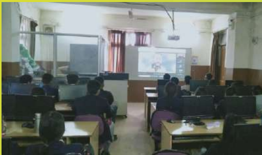
Seminar for BCA students, organised by Nehru Yuwa Kendra and DC Office Solan.