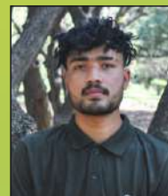
Aniket (2023) Anudip Foundation